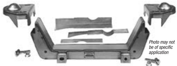
Photo may not be of specific application