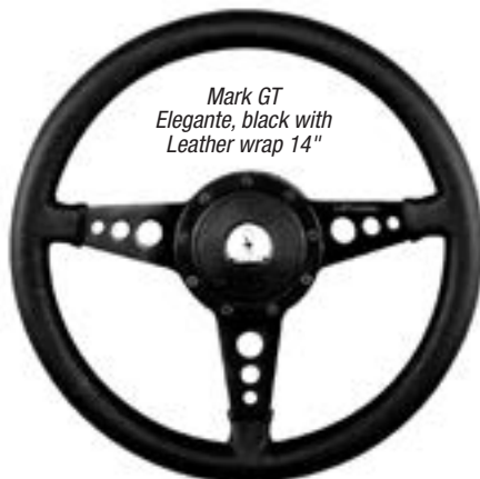
Mark GT Elegante, black with Leather wrap 14"