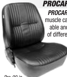
Pro-90 in black vinyl

PROCAR has seats to fit almost any hot rod, custom, muscle car or truck and designed to be safe, comfortable and supportive. Most are available in a number of different colors and materials. Bolt-in brackets are available for many applications.