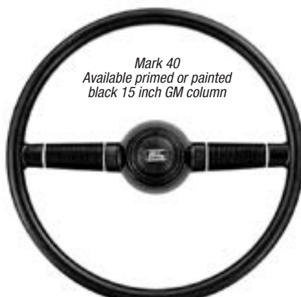
Mark 40 Available primed or painted black 15 inch GM column