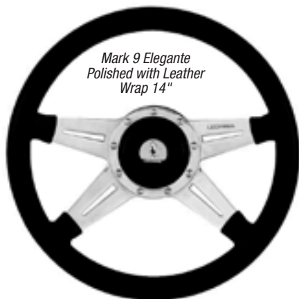
Mark 9 Elegante Polished with Leather Wrap 14"