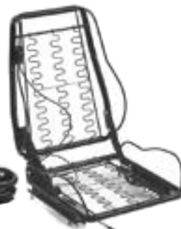
Universal Bucket Seat