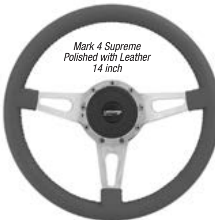
Mark 4 Supreme Polished with Leather 14 inch