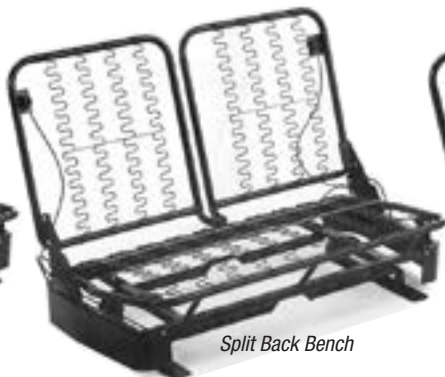
Split Back Bench