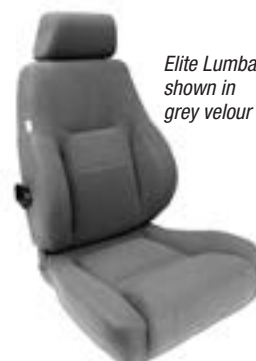
Elite Lumbar shown in grey velour