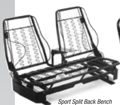
Sport Split Back Bench