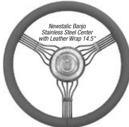
Newstalgic Banjo Stainless Steel Center with Leather Wrap 14.5"