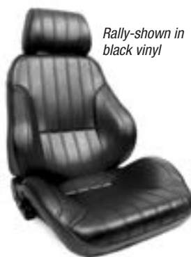
Rally-shown in black vinyl