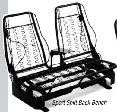
Sport Split Back Bench