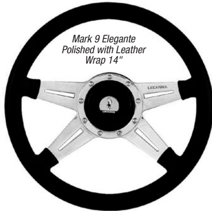
Mark 9 Elegante Polished with Leather Wrap 14"