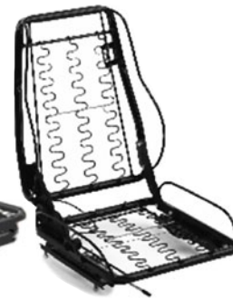
Universal Bucket Seat