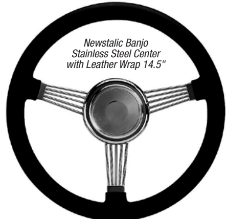
Newstalgic Banjo Stainless Steel Center with Leather Wrap 14.5"