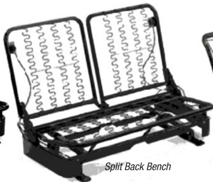
Split Back Bench