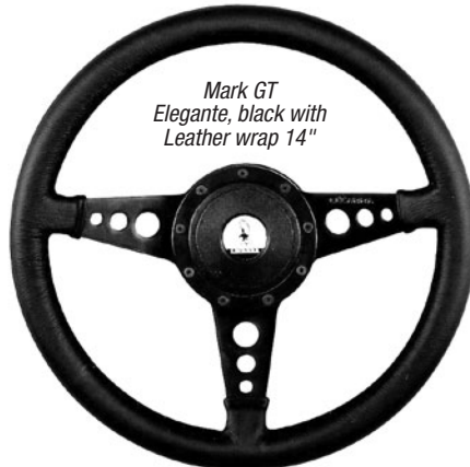
Mark 4 GT Elegante, black with Leather wrap 14"