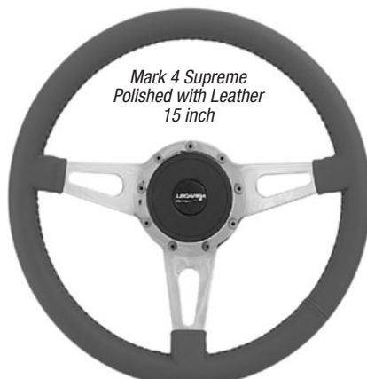
Mark 4 Supreme Polished with Leather 15 inch