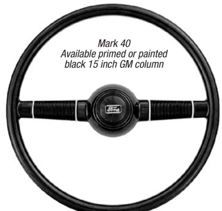
Mark 40 Available primed or painted black 15 inch GM column